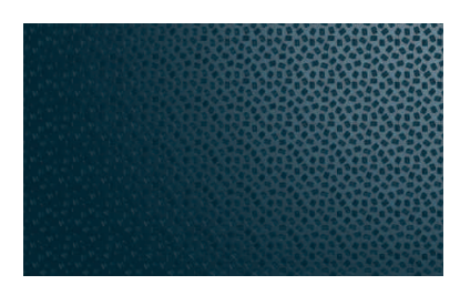
Raven (RAL 7021)