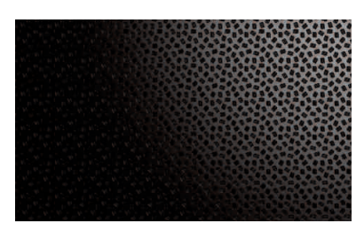
Black (RAL 9005)