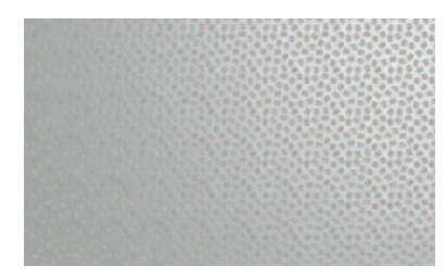
Goosewing Grey (RAL 7038)