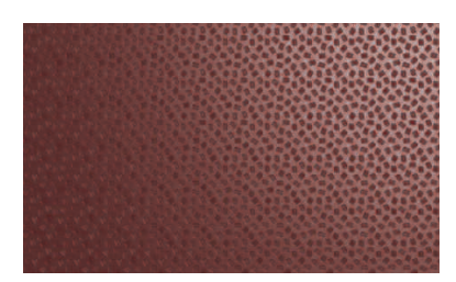
Burano (RAL 3004)