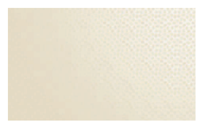
Honesty (RAL 1015)