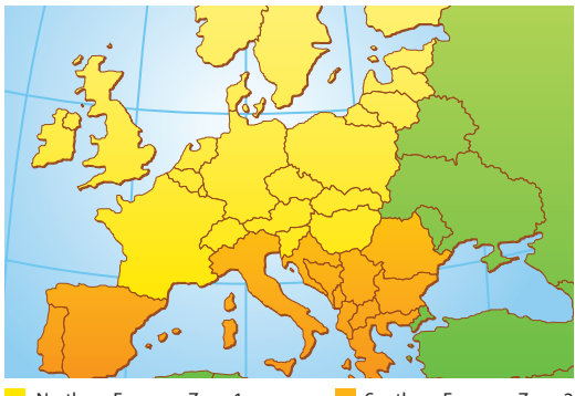
Northern Europe – Zone 1

If you want to check if your building has been registered contact the Colorcoat Connection<sup>®</sup> helpline on +44 (0) 1244 892434.