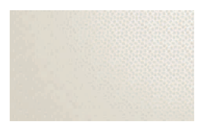
Marlstone (RAL 1013)